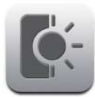
Day / night mode