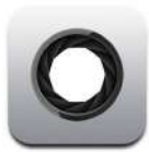
F2.0 large aperture